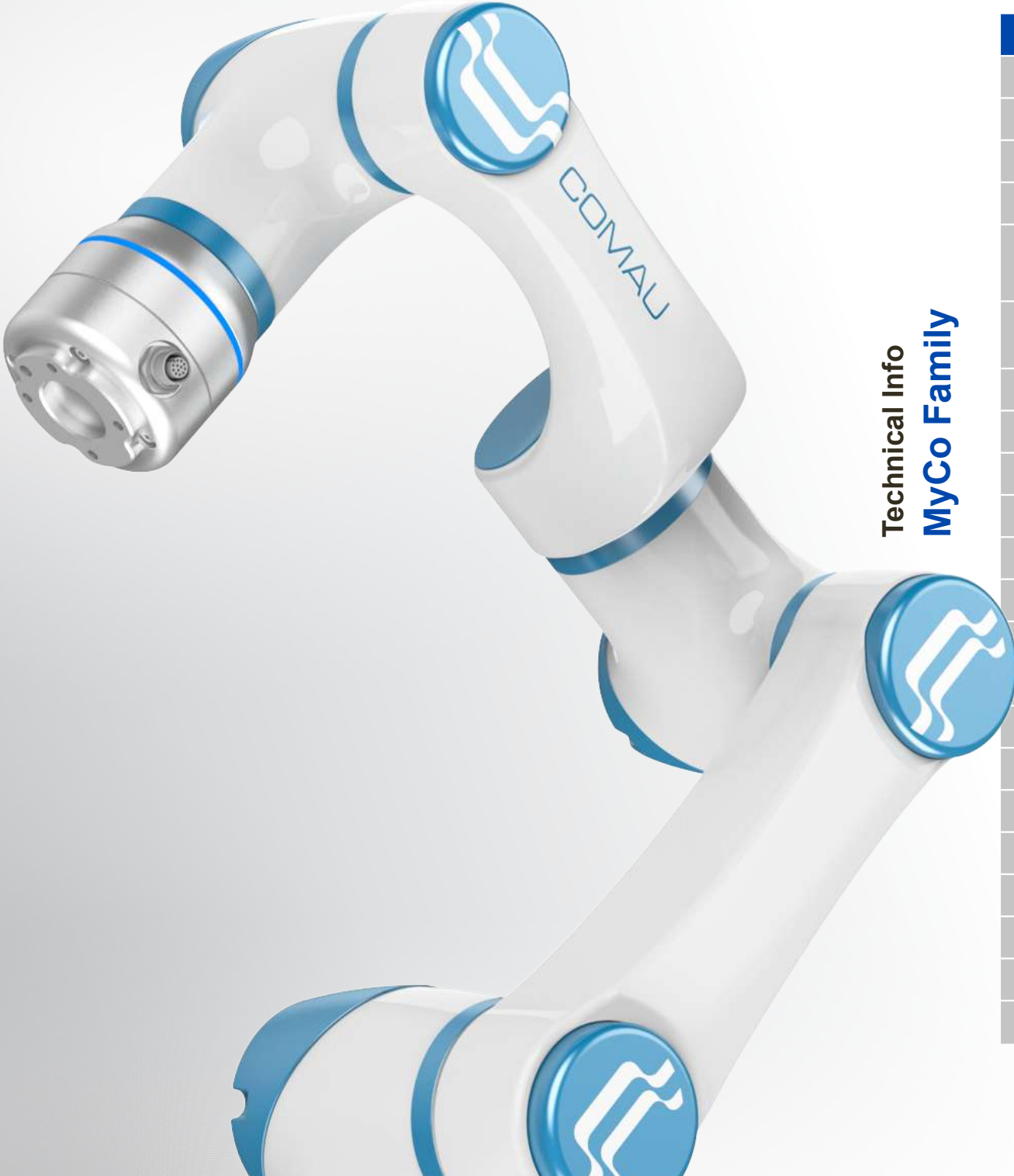
Technical Info MyCo Family