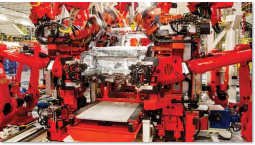
FCA Goiana Plant (Pernambuco - Brazil). Body Framing Process.

More specifically, VersaRoll is a closed-loop assembly and joining system that is primarily used for setting the geometry of subassemblies, such as body sides and the chassis. The VersaPallet system, on the other hand, can be defined as a highperformance in-line transfer system used to complete underbody and framing, joining and assembly operations. It is based on a GeoPallet that moves the body through the lines, and is able to replace the fixed underbody tooling required by the various models assembled in the system.